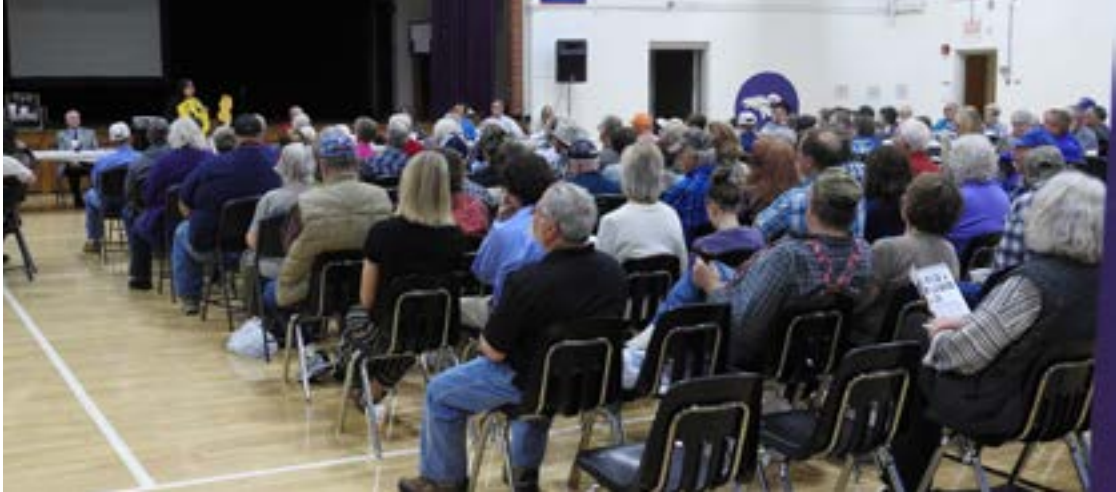
Nearly 480 members and guests gathered for the 72nd annual meeting at the Cedar Vale school gymnasium.

Caney Valley Electric held its 72nd annual meeting Thursday, March 12, 2020, at the Cedar Vale school gymnasium. There were 351 members registered, and about 480 were served a hamburger meal by the Cedar Vale Lions Club.