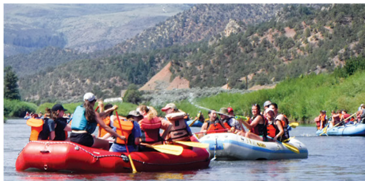
Each year, campers go rafting during Cooperative Youth Leadership Camp in Steamboat Springs, Colorado, which is scheduled for July 15-21, 2022.