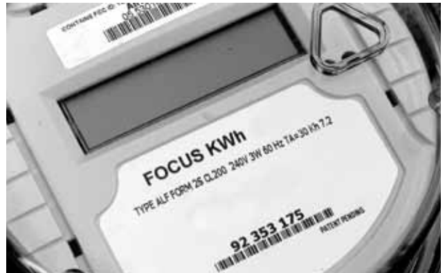
Caney Valley's Power Theft Policy could mean legal charges and fines if a member is found tampering with their meter or diverting power for any reason.

will be immediately investigated. The reporting party's name and other information shall be held confidential.