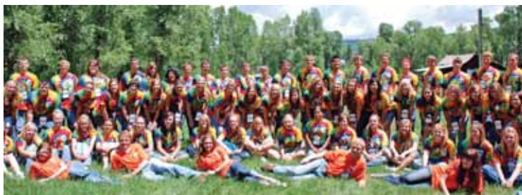
The Cooperative Youth Leadership Camp brought students together from Colorado, Kansas, Oklahoma and Wyoming.

are interested in this trip, please complete the application form below and send by February 16 to: Caney Valley Electric, P.O. Box 308, Cedar Vale, KS 67024.