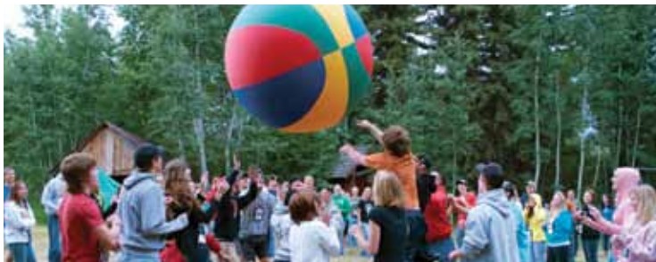
Camp participants spent their trip building leadership and teamwork skills.