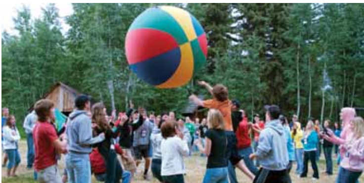
Camp participants spent their trip building leadership and teamwork skills.